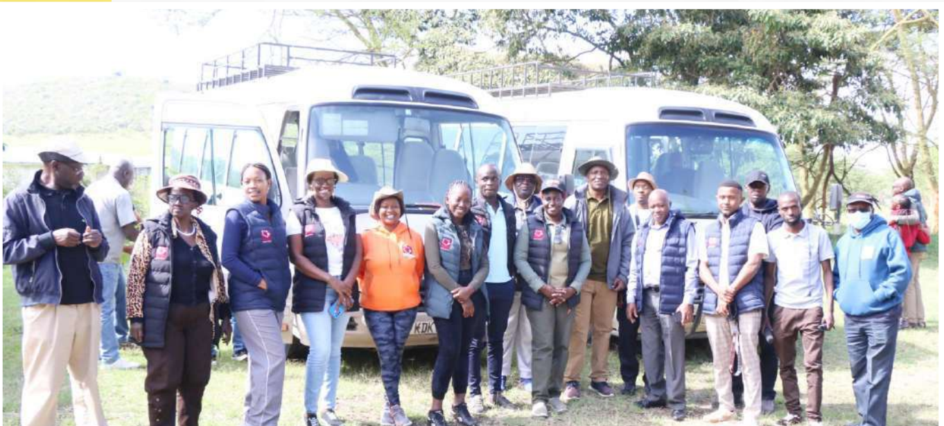
Participants of the Annual Editors Convention enjoy a game drive at Lake Nakuru National Park, pausing for a memorable group photo.