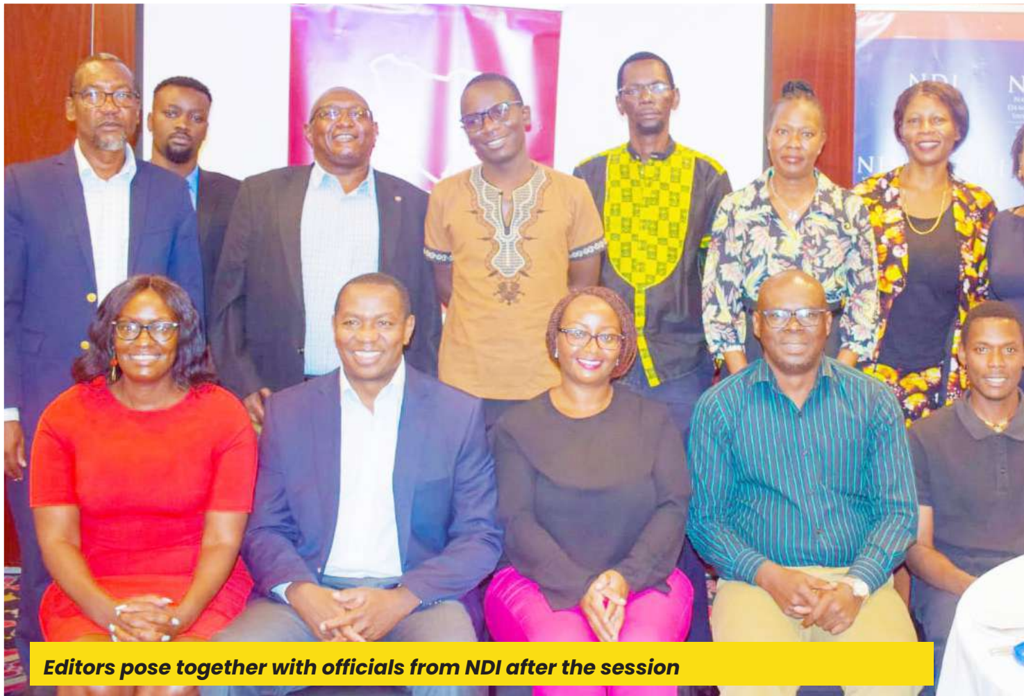
Editors pose together with officials from NDI after the session