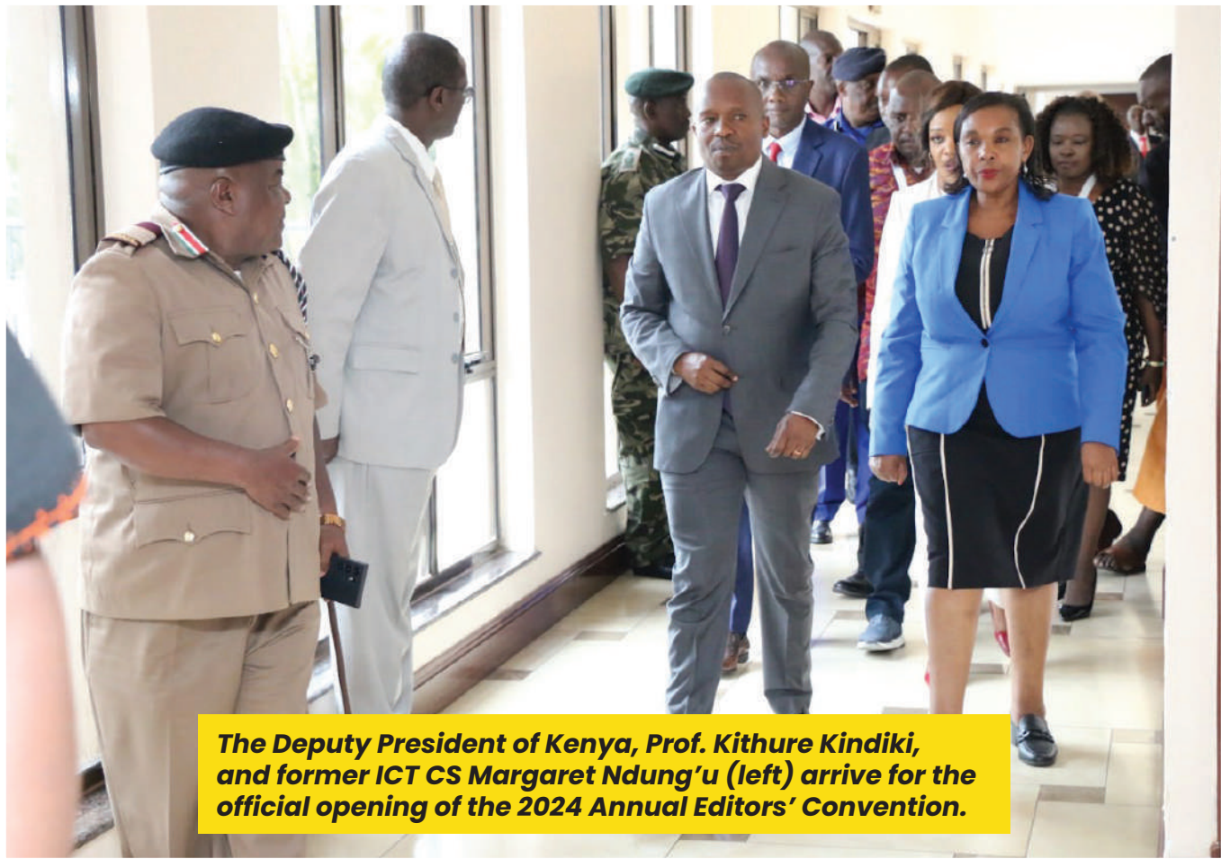
The Deputy President of Kenya, Prof. Kithure Kindiki, and former ICT CS Margaret Ndung'u (left) arrive for the official opening of the 2024 Annual Editors' Convention.