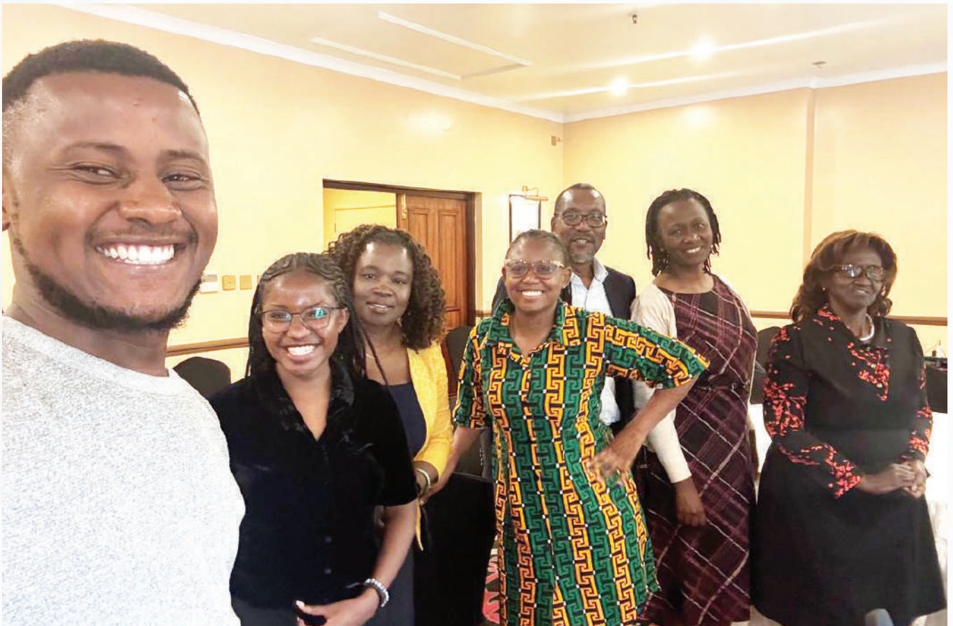
A group photo of the Kenya Editors' Guild Secretariat

The Strategy Committee is responsible for organizational sustainability and development, which includes recruitment, remuneration, staff retention, and capacity development of talent, as well as membership and fund-raising. The committee is also in charge of developing strategies for the Guild's medium and long-term decisions of the Guild. During the year, the Committee met several times to discuss its mandate, particularly to review membership applications, address arrangements for last respects, and review the sexual harassment policy, among other matters.