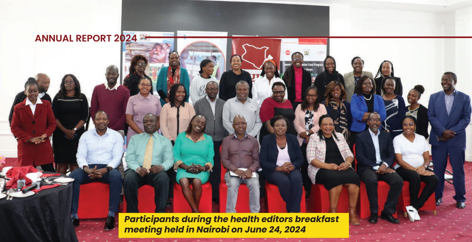
Participants during the health editors breakfast meeting held in Nairobi on June 24, 2024