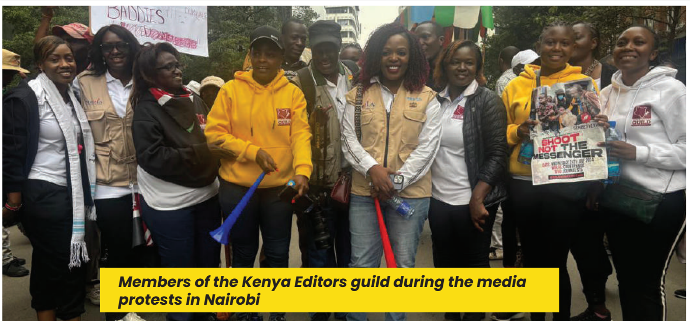
Members of the Kenya Editors guild during the media protests in Nairobi