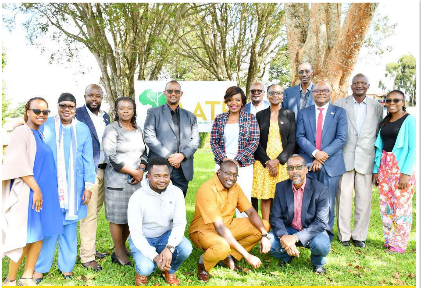
Officials from KEG and AATF pose together after the signing of the MoU at the AATF offices