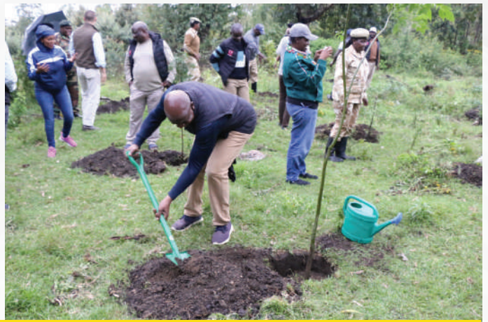
Editors take part in a tree planting session at the Menegai Forest in Nakuru