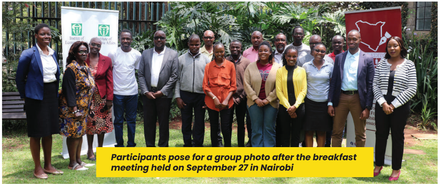
Participants pose for a group photo after the breakfast meeting held on September 27 in Nairobi