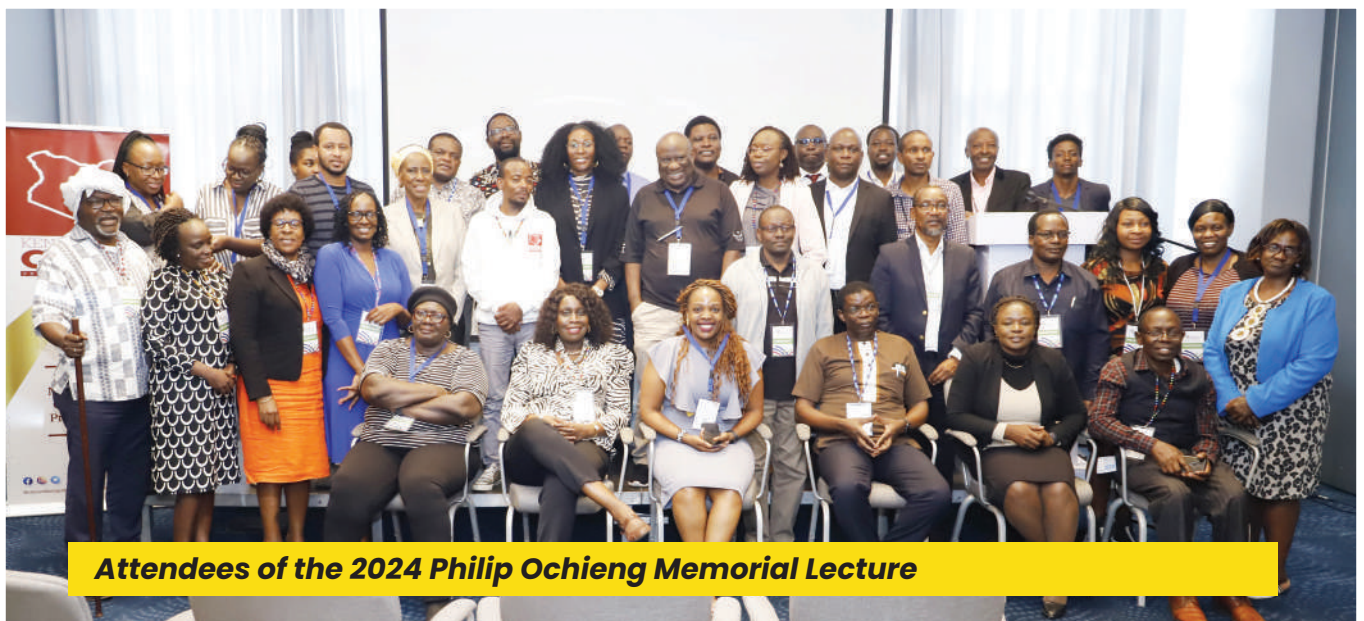
Attendees of the 2024 Philip Ochieng Memorial Lecture

event, a thought-provoking reflection on the rich history of Kenyan journalism, and its chequered past and memories, continued to provide a platform not just for introspection but also reeled out a raft of fresh ideas, and, quite importantly, an unwavering commitment to ethical journalism.