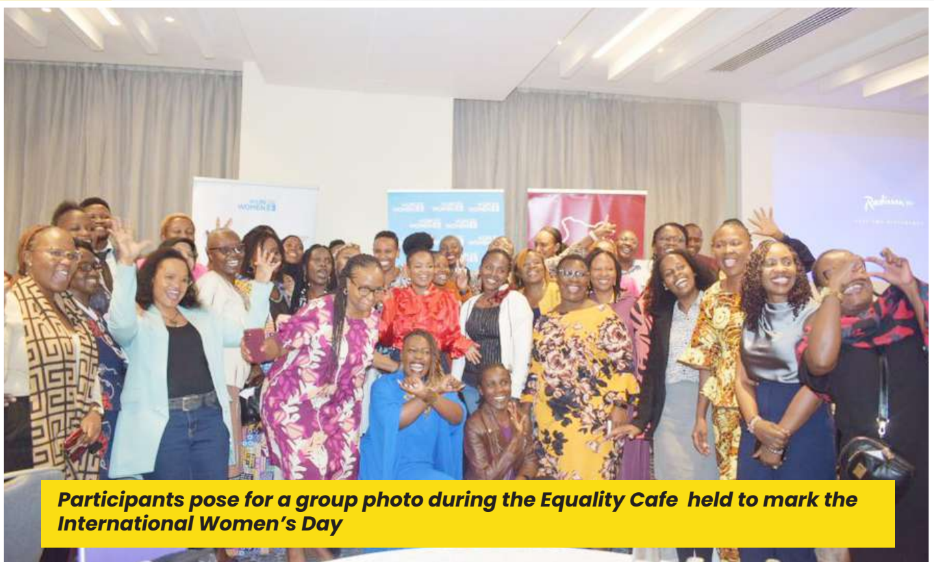
Participants pose for a group photo during the Equality Cafe held to mark the International Women’s Day