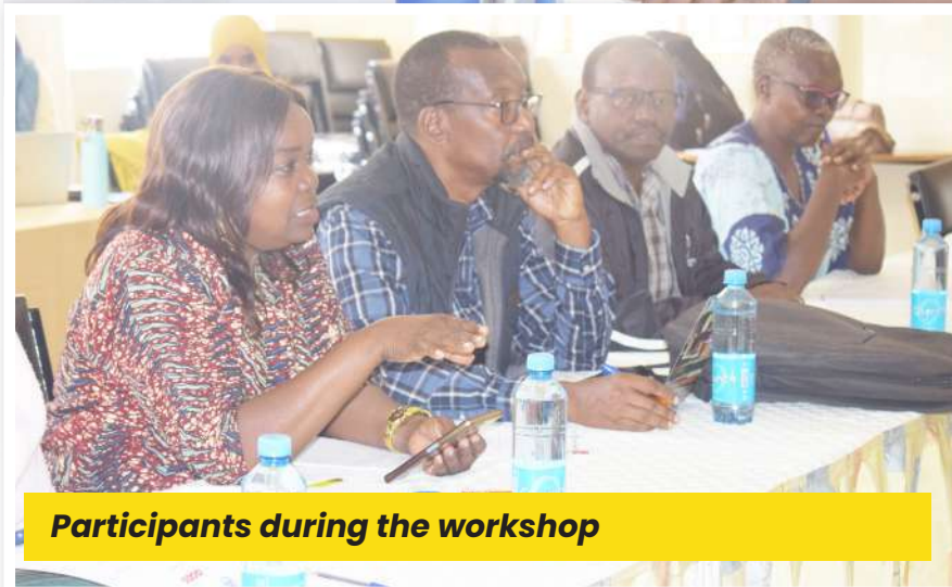
Participants during the workshop