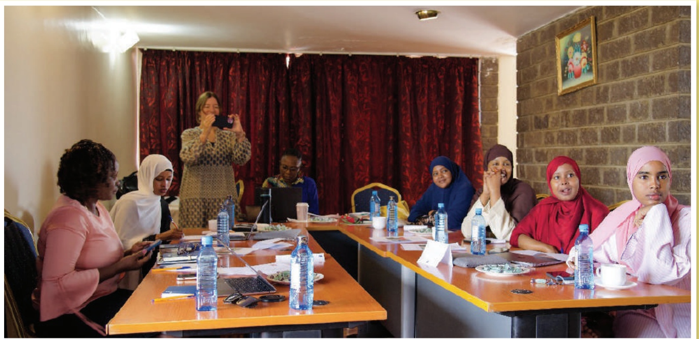
Bilan media team during their one week learning programme in Nairobi, Kenya