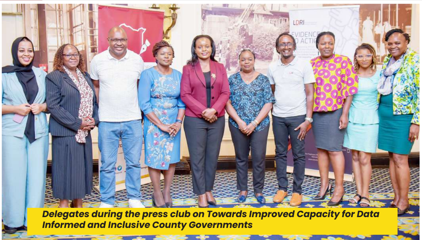
Delegates during the press club on Towards Improved Capacity for Data Informed and Inclusive County Governments