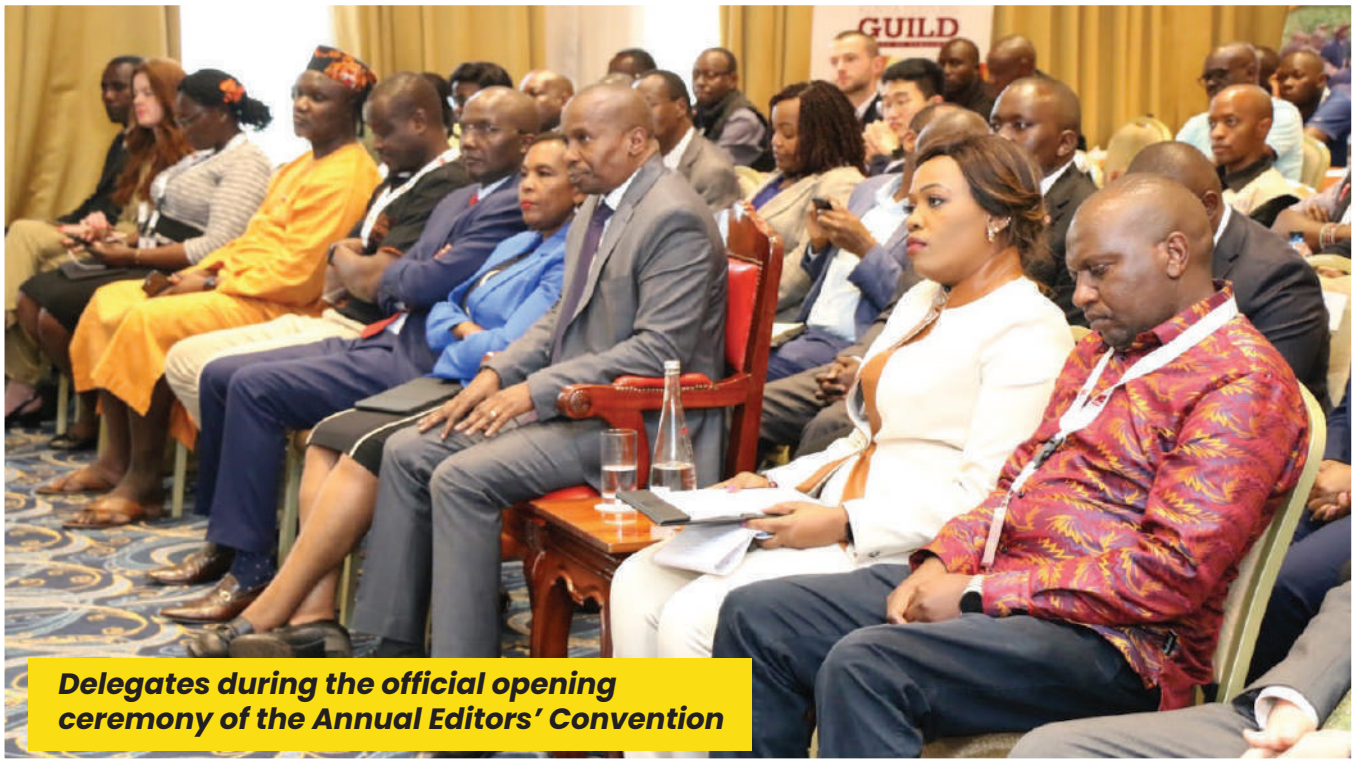
Delegates during the official opening ceremony of the Annual Editors' Convention