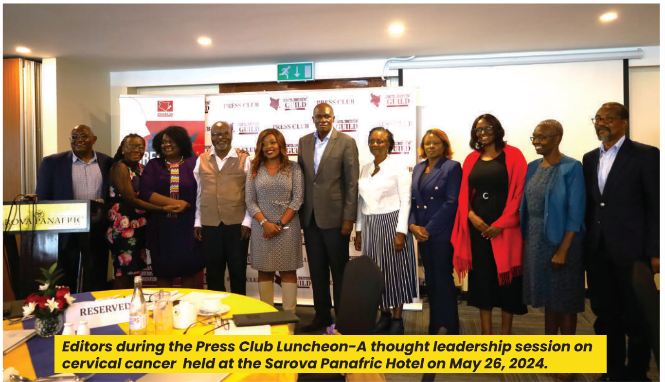
Editors during the Press Club Luncheon–A thought leadership session on cervical cancer held at the Sarova Panafric Hotel on May 26, 2024.

Press Clubs provide a platform for newsmakers to meet with editors who interrogate their work and help disseminate crucial information to the public. A second event, still under the thought leadership series, was held to raise awareness on cervical cancer. Another, in partnership with AGRA, was themed “Building resilient farming systems and becoming food and nutrition secure. Other stakeholder meetings involved AATF, Huawei, Child Fund, National Treasury, Chinese Embassy, and the Ministry of Health.