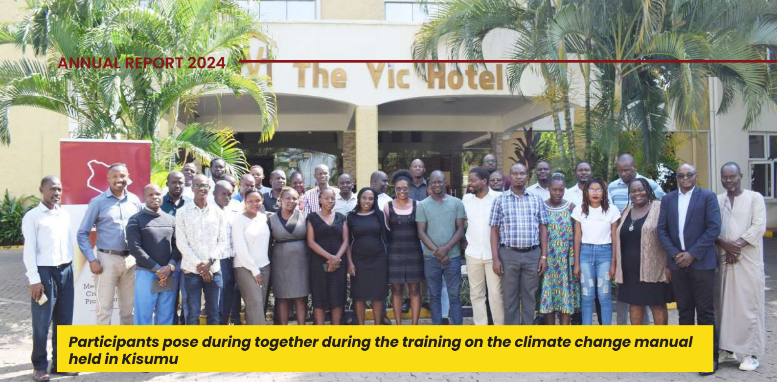
Participants pose during together during the training on the climate change manual held in Kisumu