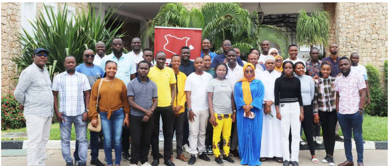
Mombasa journalists during training on the climate change manual