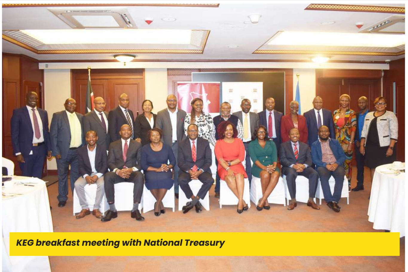
KEG breakfast meeting with National Treasury