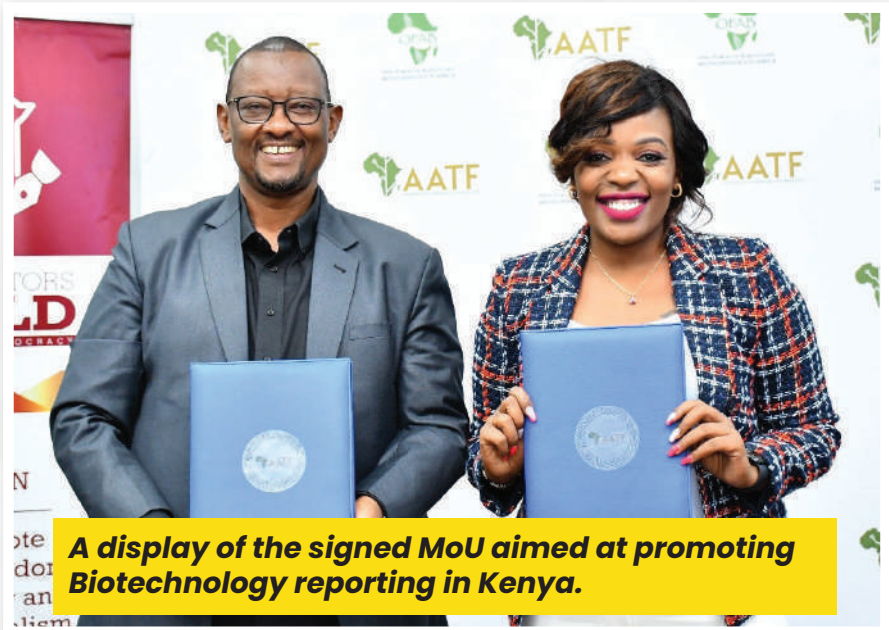
A display of the signed MoU aimed at promoting Biotechnology reporting in Kenya.