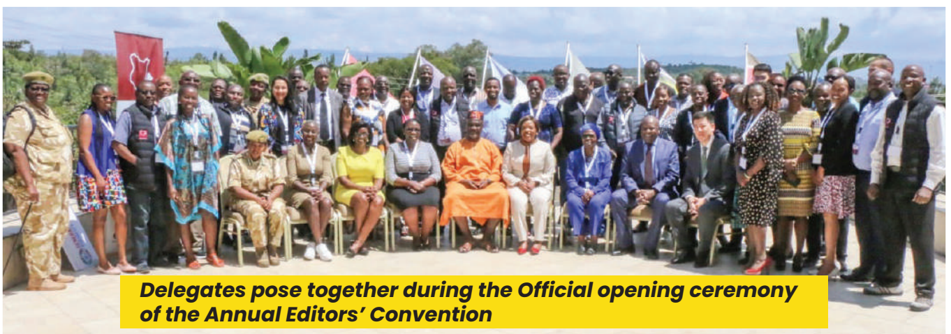
Delegates pose together during the Official opening ceremony of the Annual Editors' Convention