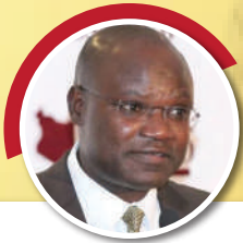
Churchill Otieno: President of The African Editors Forum (TAEF)

The Guild congratulates the following individuals for their outstanding achievements: