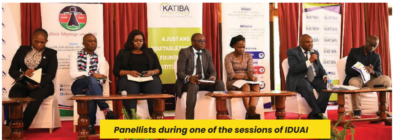
Panellists during one of the sessions of IDUAI